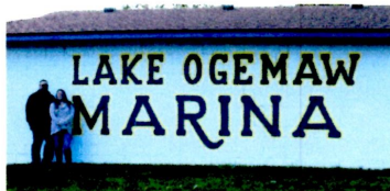
Tom Forton & Toni Erickson Owners

Avalon Pontoon Boats Aqua Cycle Paddle-Boats Great Lakes Roll-in Docks Yamaha Outboards Used Boats & Trade-ins Financing Available